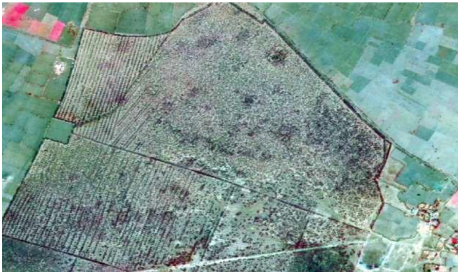
Fig.5: Textural variations

3. Texture: It refers to the arrangement and frequency of tonal variation in particular areas of an image. The visual impression of smoothness or roughness of an area can often be a valuable clue in image interpretation. Rough textures would consist of a mottled tone where the grey levels change abruptly in a small area, whereas smooth textures would have very little tonal variation as shown in figure 5. Smooth textures are most often the result of uniform, even surfaces, such as fields, asphalt, or grasslands. A target with a rough surface and irregular structure, such as a forest canopy, results in a rough textured appearance. Similarly, various density of scrub vegetation shows different texture. Uniform fields of crops, water bodies etc gives smooth texture.