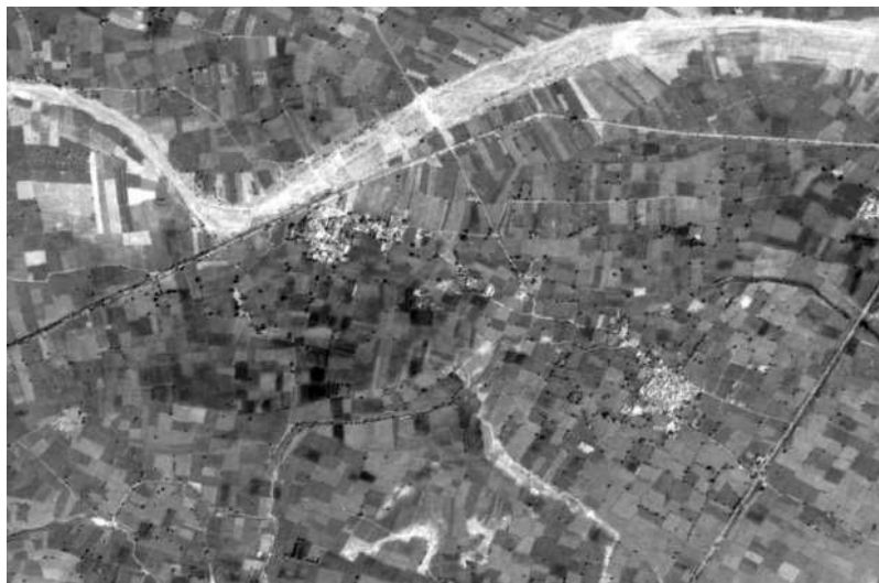
Fig.2: Tonal variations

Many factors influence the tone or colour of objects or features recorded on photographic emulsions. Human interpreter can distinguish between ten to twenty shades of grey, but can distinguish many more colours (figure 2). Some authors state that interpreters can distinguish at least 100 times more variations of colour on colour photography than shades of gray on black and white photography.