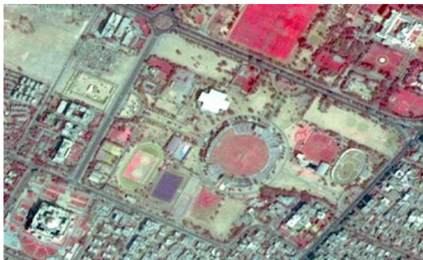
Fig.4: Shape as parameter for visual interpretation

2. Shape - Shape refers to the general form, structure, or outline of individual objects. Shape can be a very distinctive clue for interpretation. Straight edge shapes typically represent urban or agricultural (field) targets, while natural features, such as forest edges, are generally more irregular in shape, except where man has created a road or clear cuts. Similarly, roads can have right angle turns, rail lines do not. play grounds, large buildings, parks etc. have specific shapes and can easily be identified shown in figure 4.