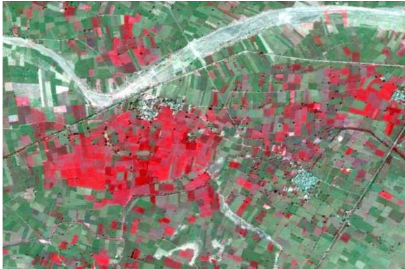
Fig.1: Colour Variations