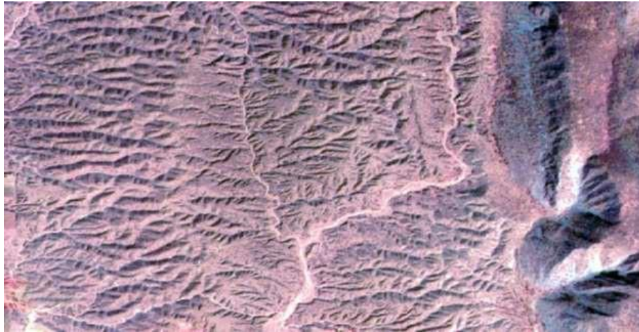
Fig.6: Pattern variations