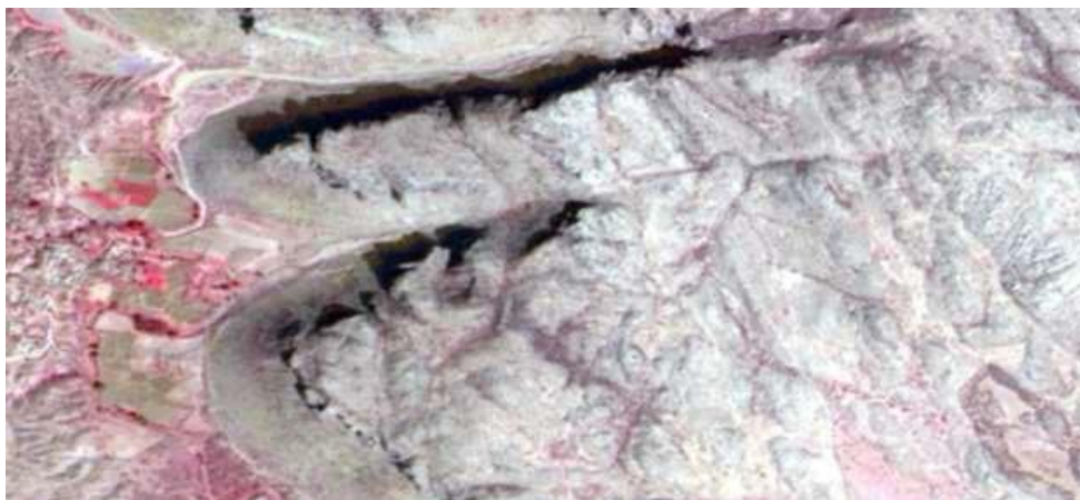
Fig.7 Shadow used for identifying topography in imagery

1. Shadow: It is useful in interpretation as it may provide an idea of the profile and relative height of a target or targets which may make identification easier. However, shadows can also reduce or eliminate interpretation in their area of influence, since targets within shadows are much less (or not at all) discernible from their surroundings. Shadow is also useful for enhancing or identifying topography and landforms (figure 7).