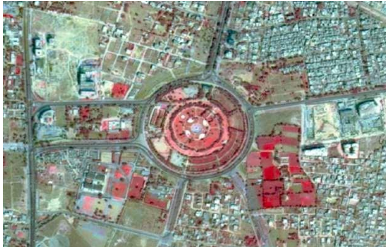
Fig.3: Size as parameter for visual interpretation

used in judging the significance of objects and features (size of trees related to board feet which may be cut; size of agricultural fields related to water use in arid areas, or amount of fertilizers used; size of runways gives an indication of the types of aircraft that can be accommodated) as shown in figure 3. It is important to assess the size of a target relative to other objects in a scene, as well as the absolute size, to aid in the interpretation of that target.