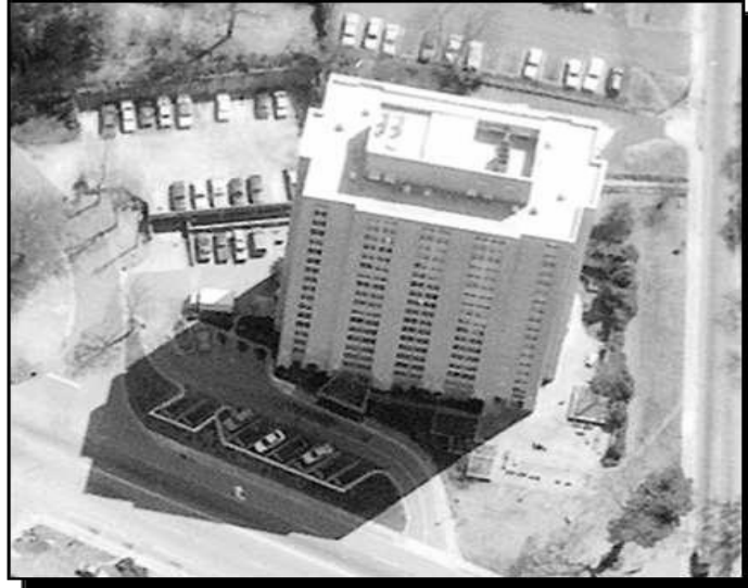
Fig.9 High rise buildings with parking arrangements